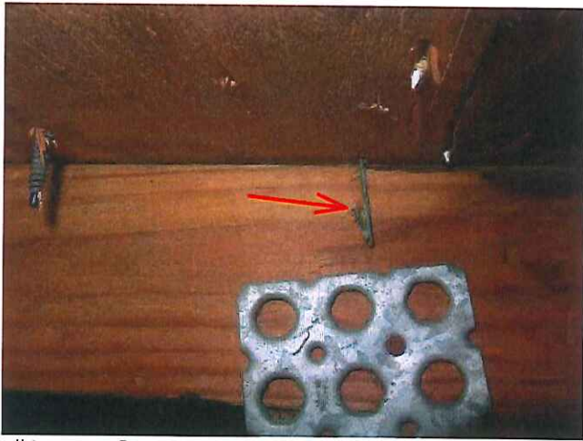
#3 Staples for roof deck attachment