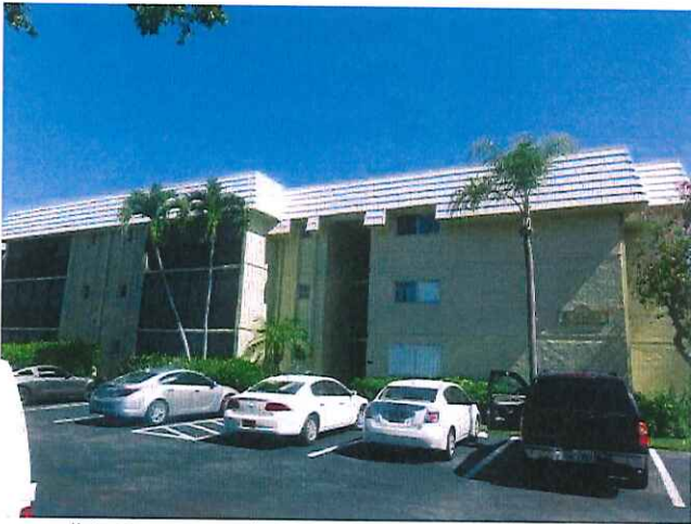
#1 Front view of the building

Page 1 of 2 Hidden Lakes788E wind inspection photographs .alb6