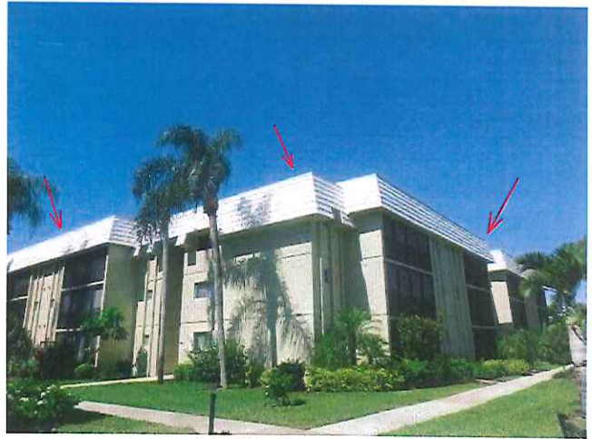
#8 Flat roof