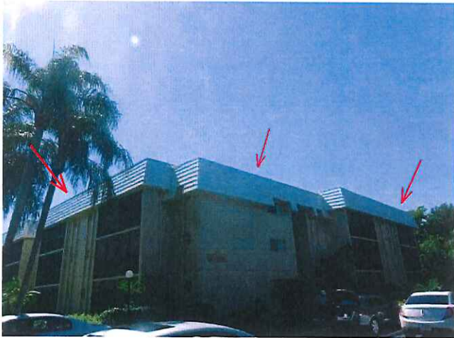
#9 Flat roof