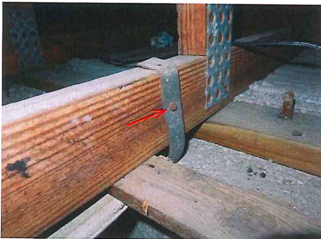
#5 Clips for roof to wall attachment with less than three nails