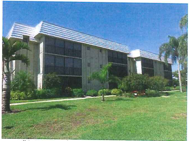
#2 Rear view of the building