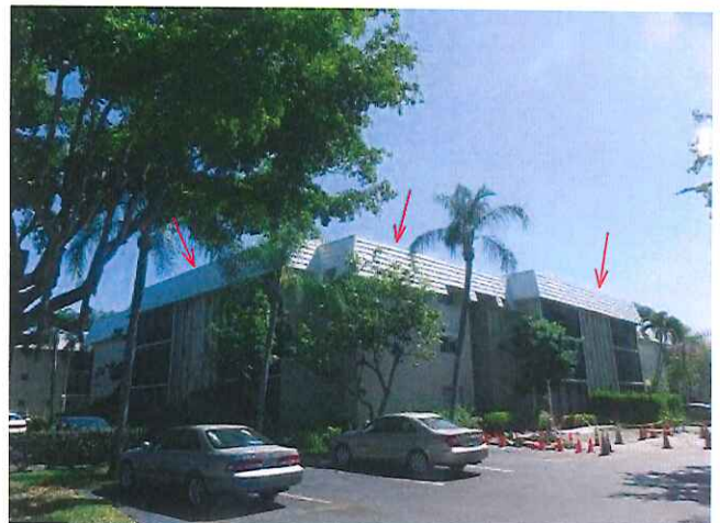
#10 Flat roof