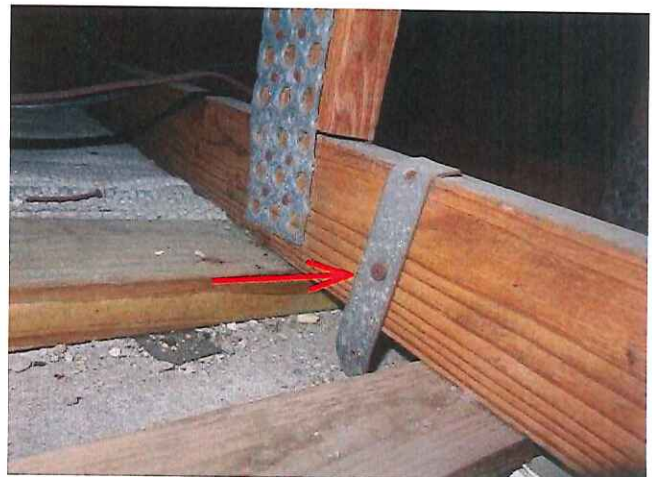
#6 Clips for roof to wall attachment with less than three nails