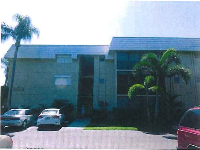
#1 Front view of the building

Page 1 of 2 Hidden Lakes788G wind inspection photographs .alb6