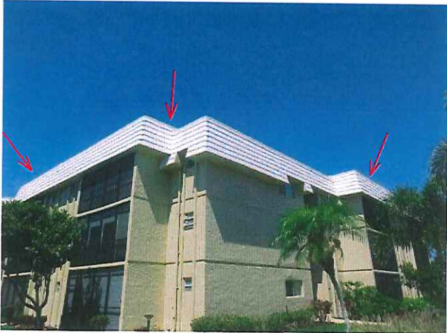
#9 Flat roof