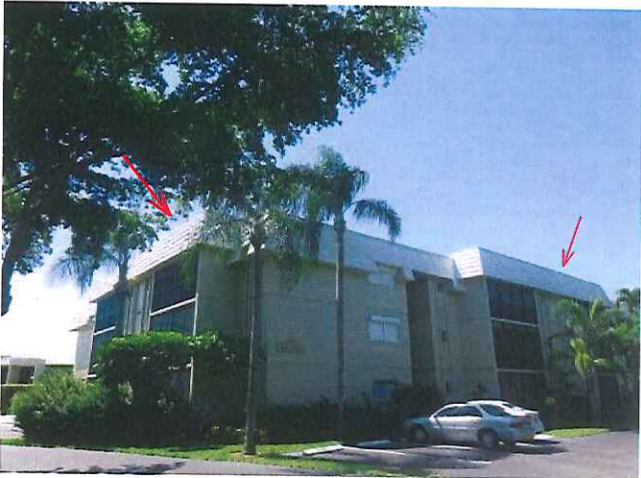
#10 Flat roof