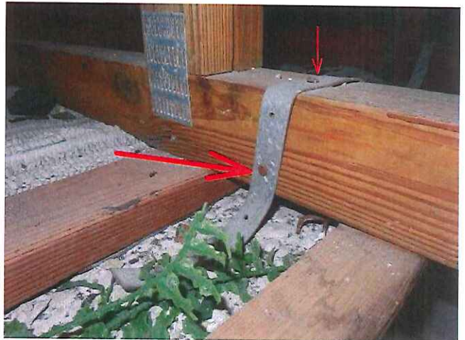
#4 Clips for roof to wall attachment with less than three nails