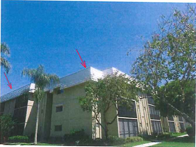
#8 Flat roof