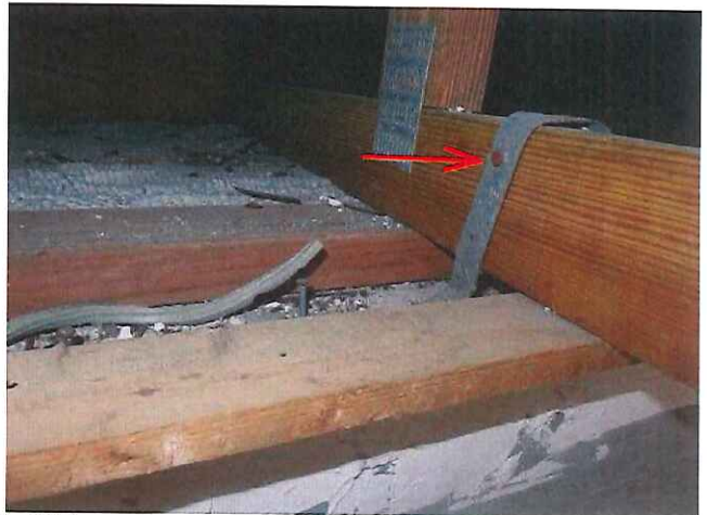
#6 Clips for roof to wall attachment with less than three nails