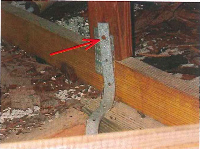
#7 Clips for roof to wall attachment with less than three nails