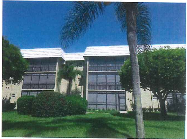
#2 Rear view of the building