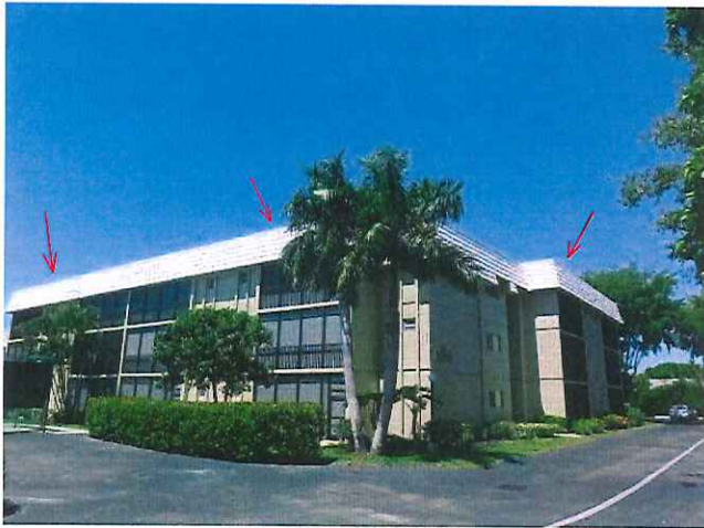
#9 Flat roof