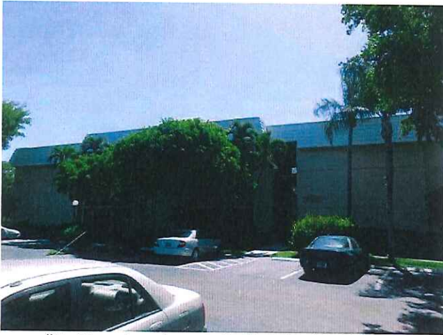
#1 Front view of the building

Page 1 of 2 Hidden Lakes788H wind inspection photographs .alb6