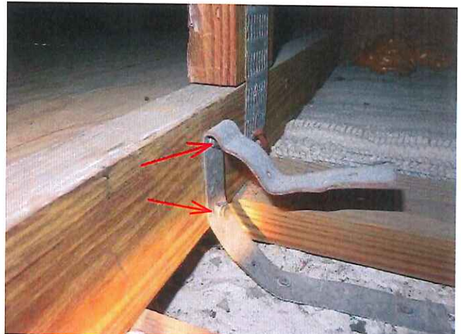
#4 Clips for roof to wall attachment with less than three nails