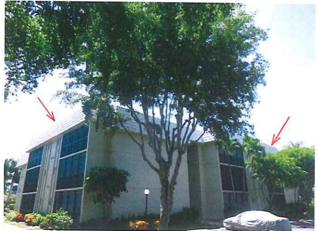
#10 Flat roof