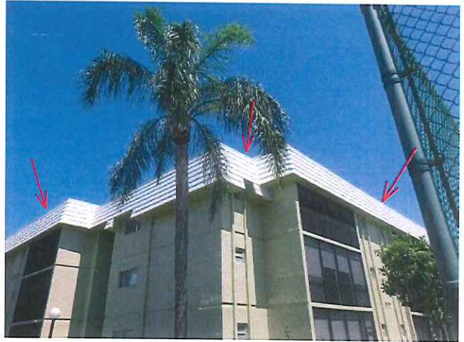
#8 Flat roof