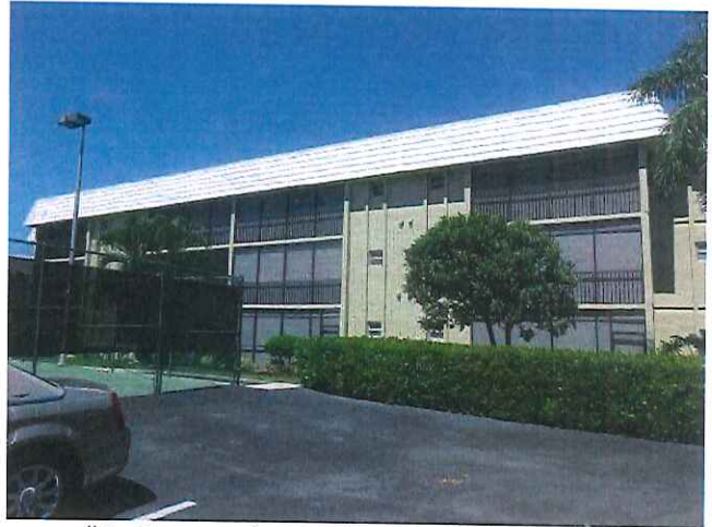
#2 Rear view of the building