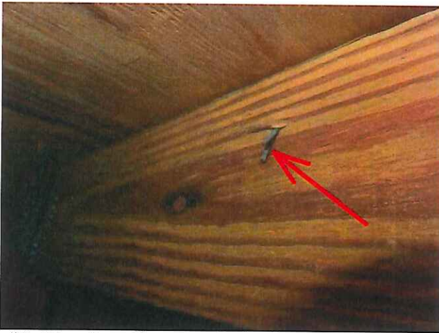
#3 Staples for roof deck attachment