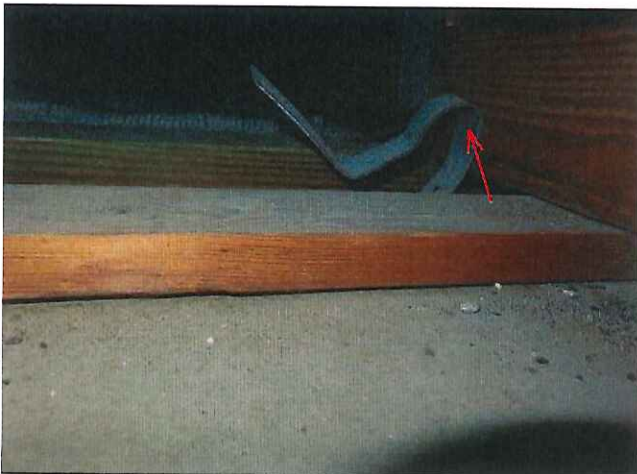
#5 Clips for roof to wall attachment with less than three nails