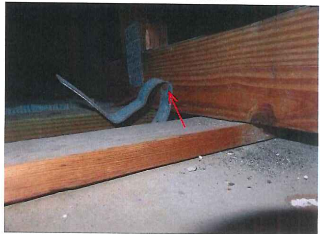
#6 Clips for roof to wall attachment with less than three nails