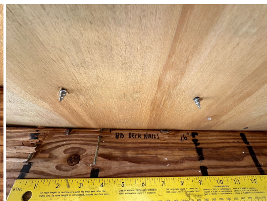
< 6" Nail Spacing