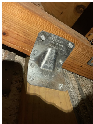
Clip RTW Connection