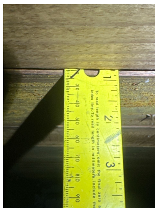
15/32" Roof Decking