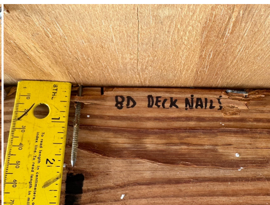
8D Nails Observed