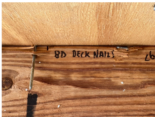
8D Nails Observed