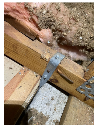
Clip RTW Connection