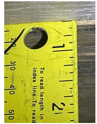
15/32" Roof Decking