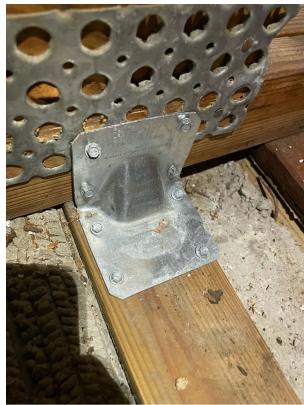
Clip RTW Connection