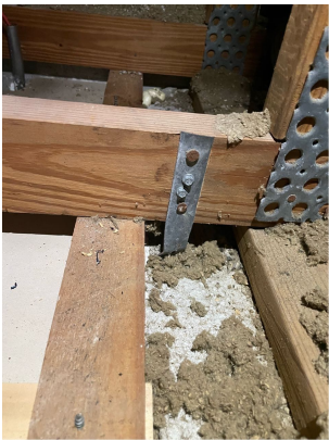
Clip RTW Connection