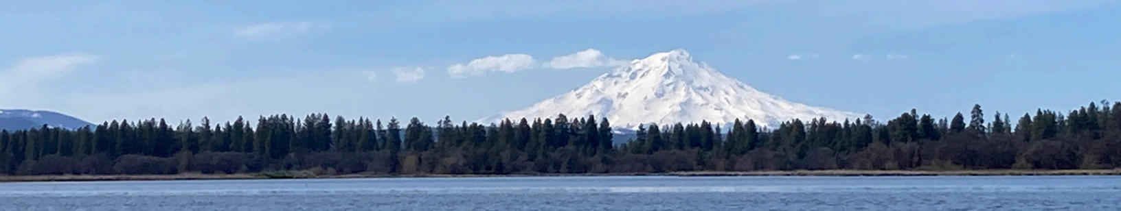
Mt. Shasta, seen from Ahjumawi Lava Springs SP