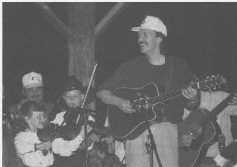
Mark O'Connor with students at the 1994 Mark O'Connor Fiddle Camp

The thing that I see right now that has made the biggest difference is that a lot of little kids that wouldn't have normally been fiddlers, that would have gone on to study in a conservatory, are looking at fiddling as an option, because their parents are getting into it. Most of the time, I was really unique, in my situation. People couldn't believe that my mom or dad didn't play the fiddle. "Then what are you doing playing the fiddle?" Obviously you do it because your