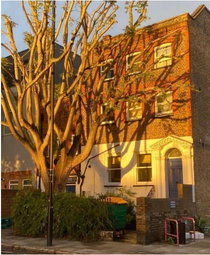
Front of Balaam Street, Plaistow