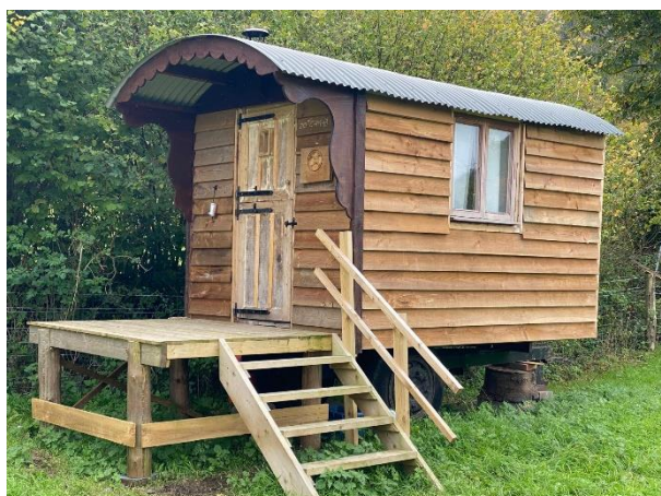
The Shepherd's Hut at Hilfield

Hospitality is an essential part of the brothers' ministry. All our houses welcome guests – those looking for rest, retreat, study and renewal. People come, not to a hotel or conference centre, but