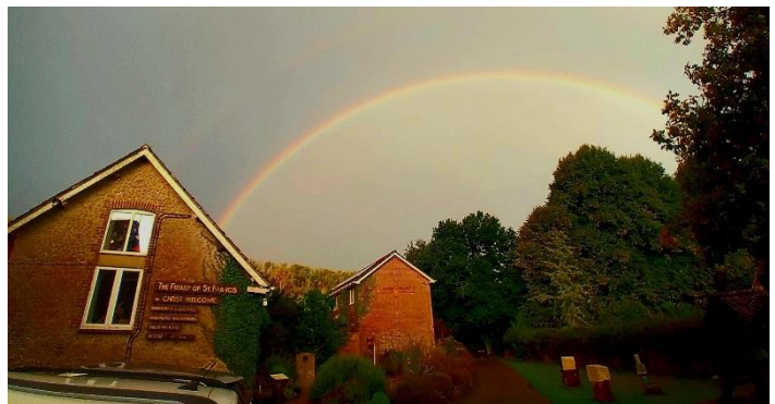
Hilfield Community photo 2025 and a rainbow over the Friary