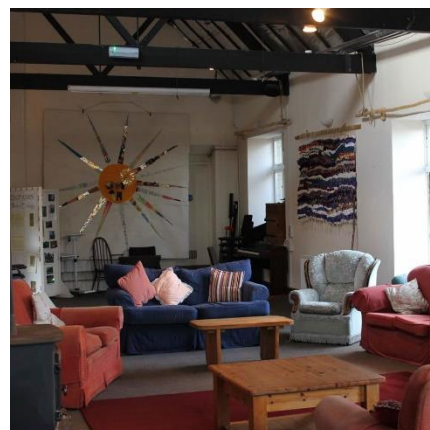
The Recreation room at Hilfield

Here are some comments from those who have stayed at one or other of our houses during the past year: