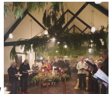
The Chapel at Hilfield

Communicating the Christian faith through preaching and teaching in churches, schools and colleges. Brothers respond to invitations to speak at conferences and to lead retreats and pilgrimages. One brother has a parish appointment and those who are priests are sometimes called upon to cover in churches where there is no resident vicar. Day and residential courses are organised for the public at two of our houses. Over the course of the past year several hundred engagements have been undertaken by brothers, including a visit by brothers to Sweden