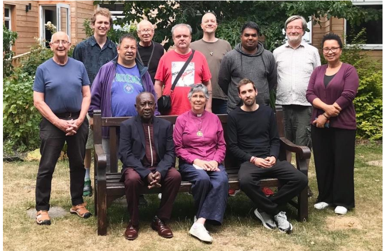
The Community at Plaistow