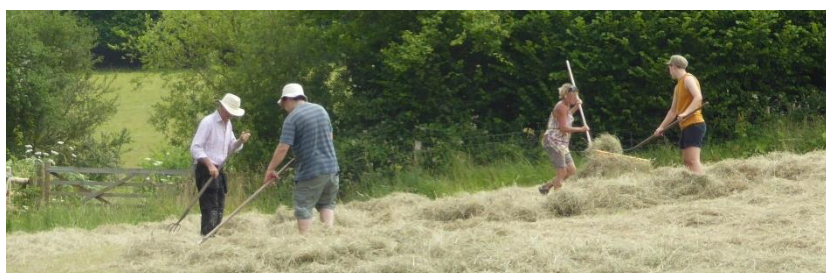
Haymaking at Hilfield

the friary in Plaistow, involved work on insulation, the installation of solar panels and of a storage battery. Energy audits have been undertaken on three of our friaries and there is a five-year programme to reduce our use of fossil fuels towards zero. The conservation programme on the land at Hilfield, working in collaboration with Natural England, the Dorset Wildlife Trust and Dorset County Council, has become a landmark project in the area, with opportunities for groups from schools and other organisations to learn about the foundations of a healthy relationship with the natural world around us.