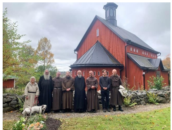
SSF Brothers visiting Sweden

Communicating the Christian faith through preaching and teaching in churches, schools and colleges. Brothers respond to invitations to speak at conferences and to lead retreats and pilgrimages. One brother has a parish appointment and those who are priests are sometimes called upon to cover in churches where there is no resident vicar. Day and residential courses are organised for the public at two of our houses. Over the course of the past year several hundred engagements have been undertaken by brothers, including a visit by brothers to Sweden