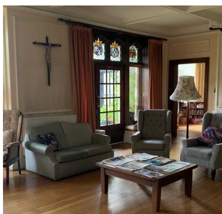
Alnmouth's Sitting room and a guest bedroom

to a community where something of the life of the brothers can be shared. Some people seek sanctuary and help from difficult situations in life and are supported with kindness, care and friendship. No charge is made and although people may be invited to make a donation towards the cost of their stay, no-one is turned away on account of an inability to contribute.