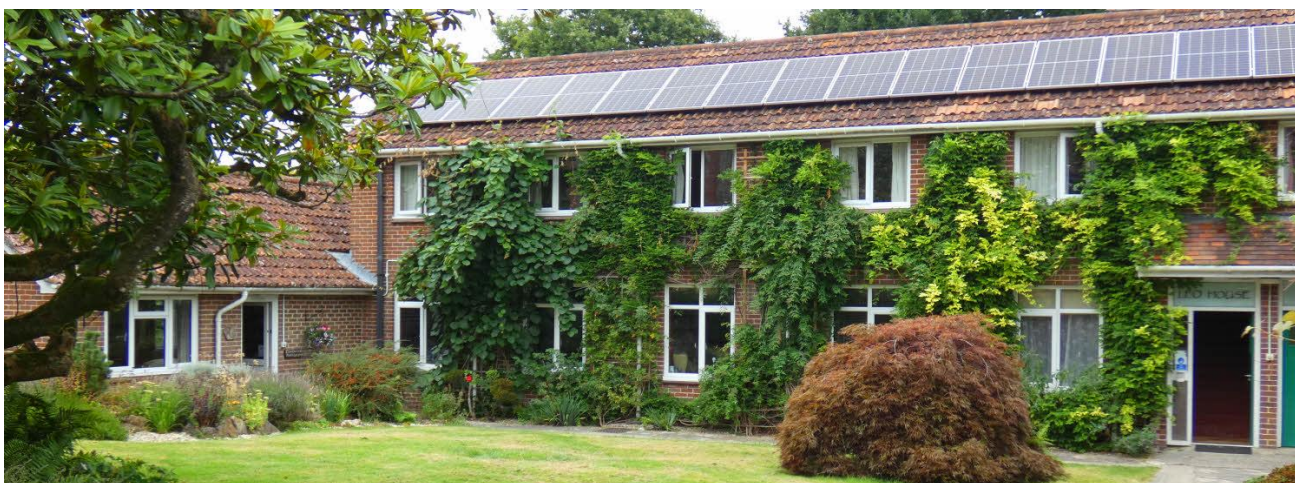
Solar panels on Leo Guest House roof at Hilfield