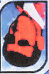
John "David" Dever (1942-1981) Memorial Scholarship, Award-$500