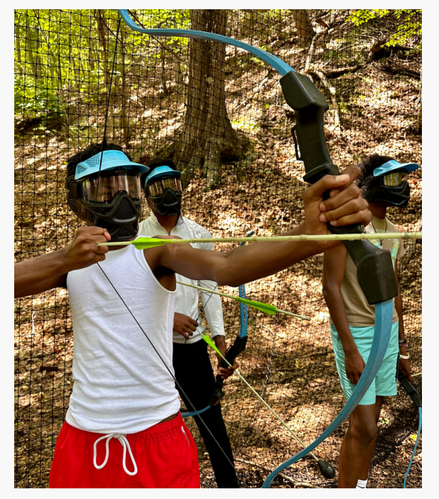
In school, our staff will teach "Habitude" lessons, or in other words, habit-forming attitudes. Thanks to Growing Leaders, our students will be equipped to enter the world with the disposition of a leader.

Once enrolled in their Freshman Year, students remain in the program until they graduate. Students experience bi-weekly inschool workshops, as well as monthly one-on-one meetings with staff and volunteer mentors.