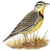
San Bernardino Valley Audubon Society