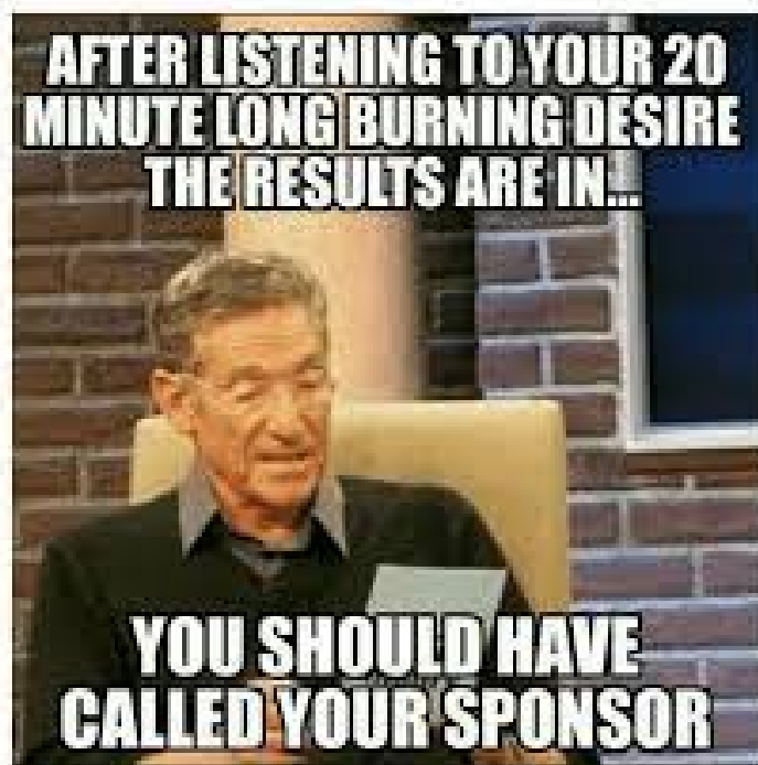
Funny sobriety Memes