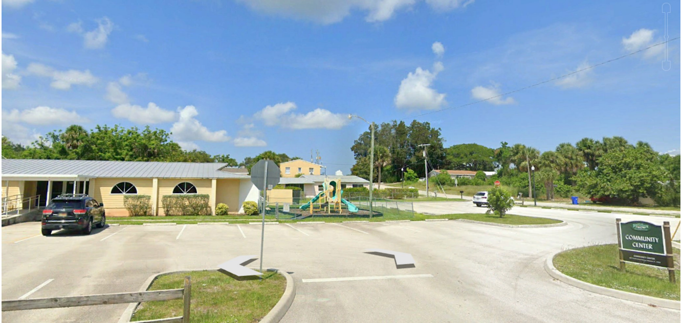
SESEBASTIAN COMMUNITY CENTER -1805 N.CENTRAL AVE SEBASTIAN NEWPORT CLUB—2536 17TH AVENUE, VERO BEACH

Make plans to attend the 2025 Alcoholics Anonymous International Convention Vancouver, British Columbia, Canada Visit https://www.aa.org for up-to-date information