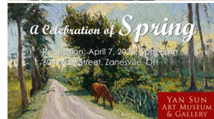
"A Celebration of Spring"