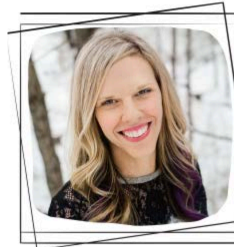
Artist of the Month

Join us for the November First Friday ArtWalk, November 1st from 5pm - 8pm.