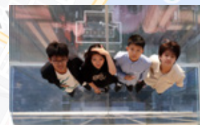
One Summit Vanderbilt Stunning views of NYC