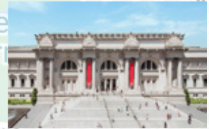
The Metropolitan Museum of Art Leading art museum in the world