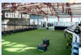
Chelsea Piers Comprehensive sports hub (optional)