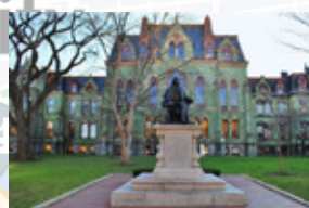
University of Pennsylvania #7 ranked U.S. university

Other New York City visits not showcased above