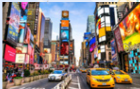
Times Square Hub of entertainment & tourism