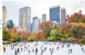
Central Park Beautiful, main park in NYC