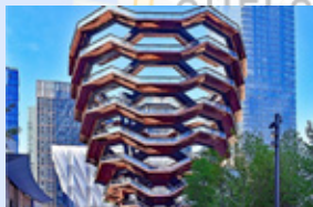
Hudson Yards New hotspot for art & leisure