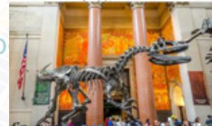
American Museum of Natural History Leading science museum in the world