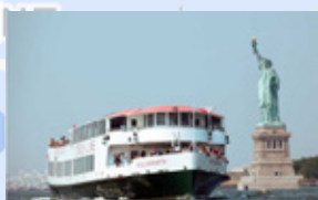
Circle Line Cruise Stunning views of NYC's landmarks