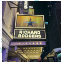
Broadway Shows Popular musicals and plays (optional)