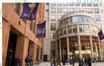
New York University #24 ranked global university