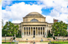
Columbia University NYC's Ivy League university