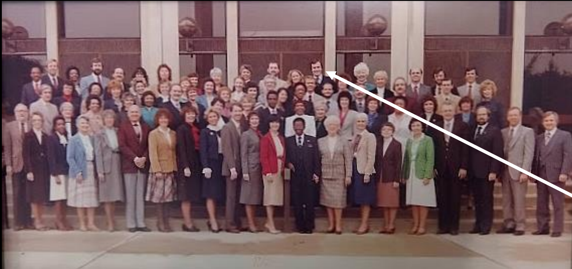
Unity Ministerial School Class of 1984