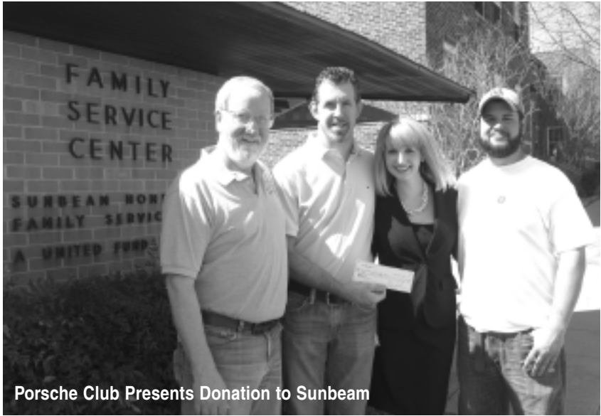
Porsche Club Presents Donation to Sunbeam