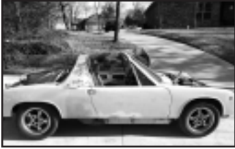
On the cover - Porsche 914