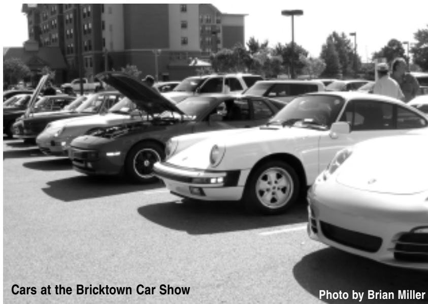
Cars at the Bricktown Car Show