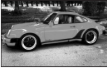
On the cover - Porsche 911 Turbo