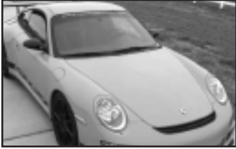
On the cover - Porsche 911