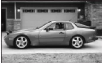
On the cover - Porsche 944 Turbo