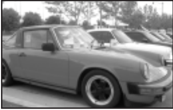
On the cover - Porsche 911 at car show.