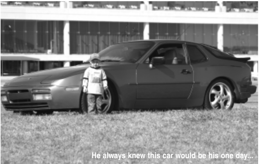
He always knew this car would be his one day...