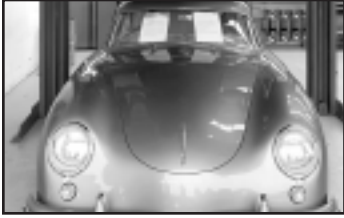
On the cover - Porsche 356