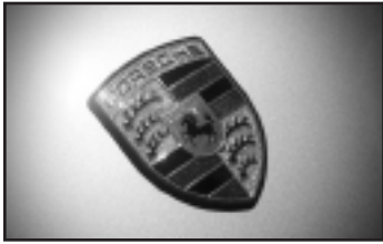
On the cover - Porsche Hood Badge.