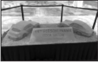
On the cover - Sand Sculpture