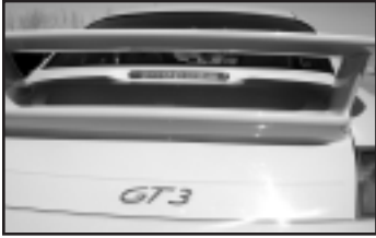
On the cover - Porsche 911 GT3