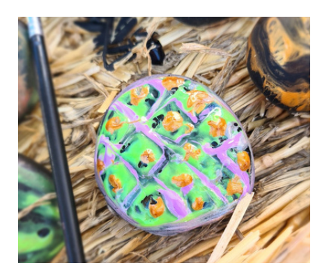
Turtle Rock Art