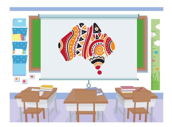
Show visual aids