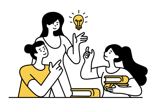
Discuss cultural practices