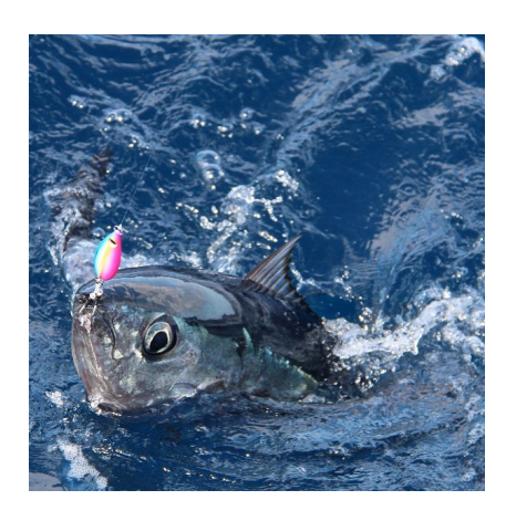
Another tuna caught on the Flat Fall Lure.

Boats are putting together some impressive counts due to the epic weather and biting fish. This group of anglers traveled roughly forty miles off the coast to capture these fish. Private boaters and sport boats searching 35-50 miles from West Port, Illwaco, and Garibaldi are having great success.