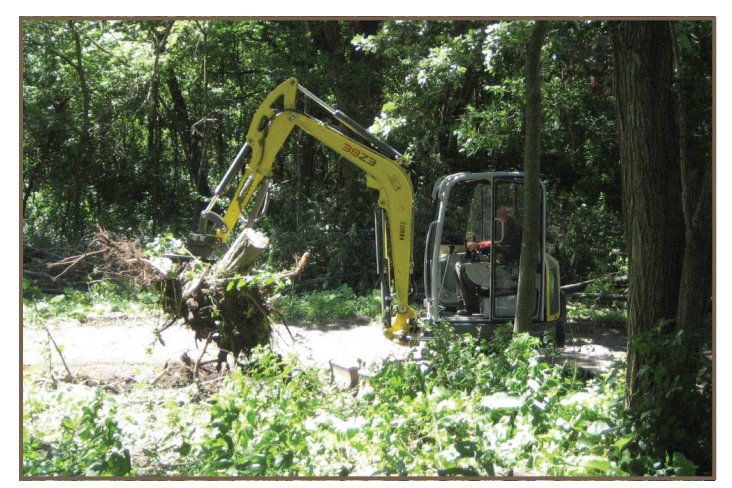
Summer 2015: Tom Insley clearing the building site with his excavator, pulling stumps and moving brush off the property. Construction will begin this summer.

2114 Stagecoach Trail ·Stillwater, MN 55082