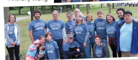
Sept 2016: Our team at the Walk for Thought