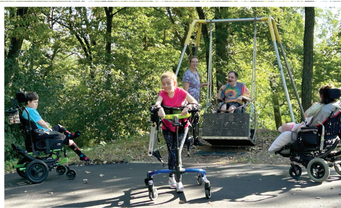
Upper turnaround provides a place to roll, ride and swing. Residents can use walkers, be moved around and get to the swing without getting muddy tires. A perfect playground!