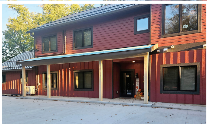
New covered entry and sidewalk, with overhead lights to brighten up the entrance for the night shifts arrivals. Note the sidewalk ramp on the right for residents and deliveries.