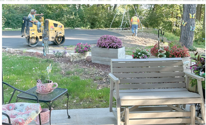
Asphalt driveway covers turnaround and access to wheelchair swing, plus easier parking to bring residents up to sidewalk off the upper porch. It creates a seamless surface for all-year use.