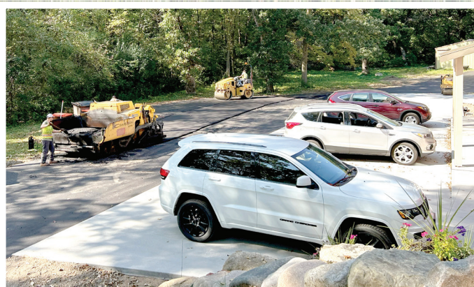
Concrete parking area up to the new porch entry, and the asphalt driveway up to utility shed, pole barn and concrete pads for trash and recycling bins. No more muddy parking!