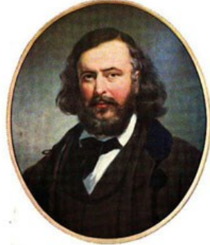
Albert Pike, 33°

"We must pass through the darkness to reach the light." — Albert Pike, 33°