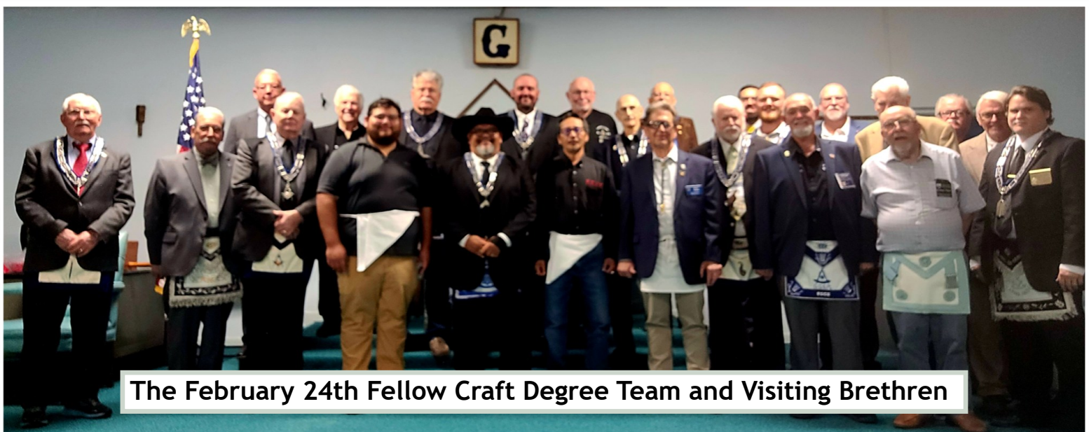
The February 24th Fellow Craft Degree Team and Visiting Brethren