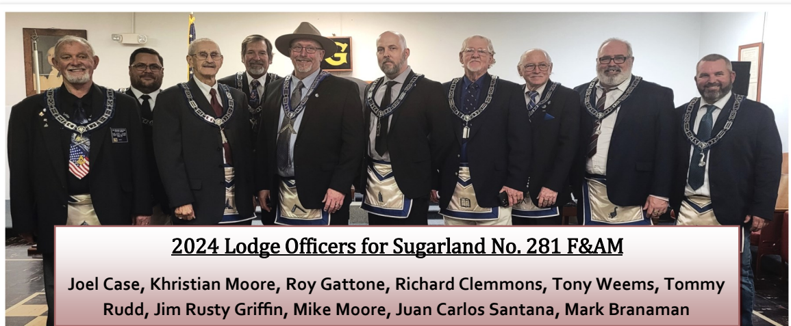
2024 Lodge Officers for Sugarland No. 281 F&AM