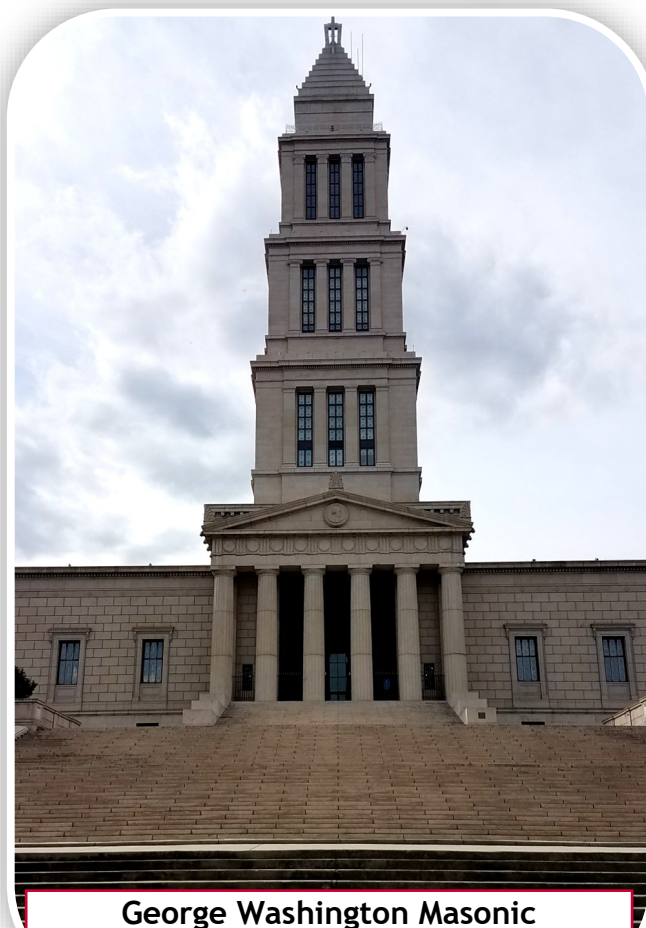
George Washington Masonic National Memorial