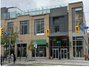
Mountain Equipment Company - Flagship)