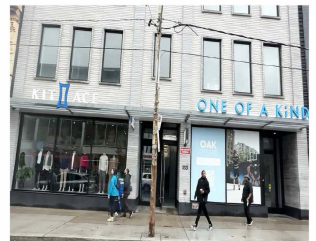
OAK One of a Kind - Flagship 2023)