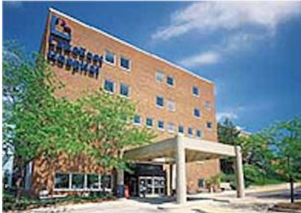
(*Legal) LakeEast Hospital, Painesville, OH 2004 *Prevented Legal Action