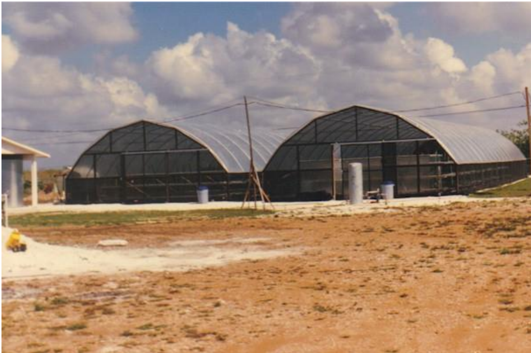
1986 Homestead Florida ¼ Acre Test Facility