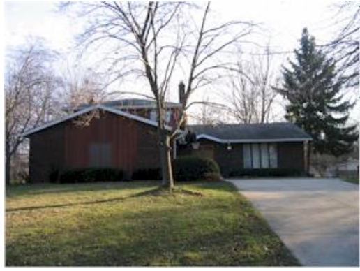
(**Foreclosure) Westlake, OH 44145 2006 **Foreclosure Action – Assessment