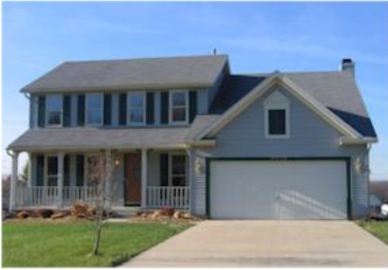
(*Legal) Sagamore Hills, OH 44067 2006 *Prevented Legal Action