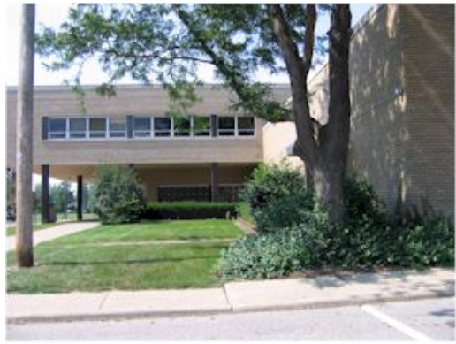
(*Legal) Cuyahoga Health Clinic Cleveland, OH 44114 2006 *Successful Remediation & IAQ-Certification