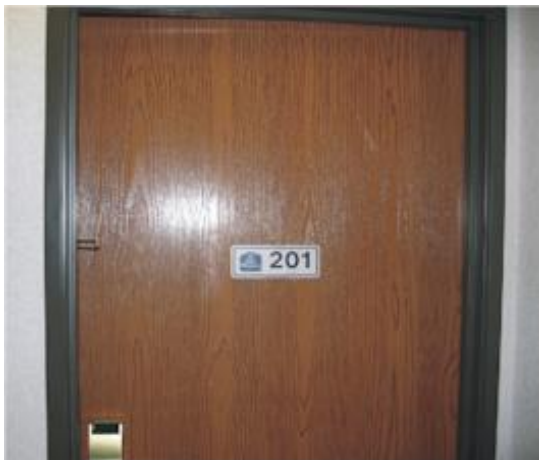
(*Legal) Best Western Hotel, Streetsboro OH 2005 *Prevented Legal Action