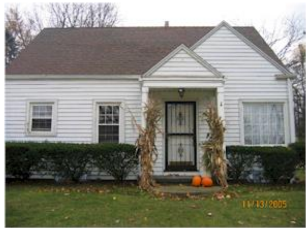
(*Legal) Cuyahoga Falls, OH 44223 2005 *Prevented Legal Action – Successful Negotiation