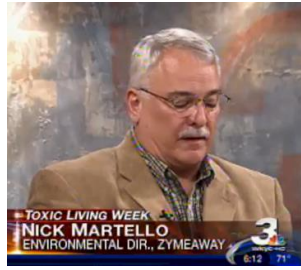
TV Interview About ZymeAway