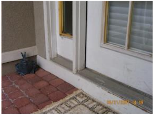
(**Foreclosure) Beachwood, OH 44122 2007 **Foreclosure Action - Assessment