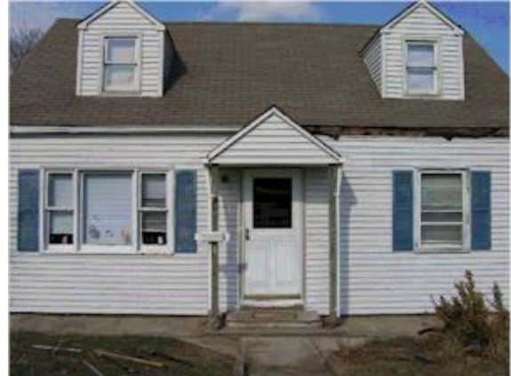
(Legal) Belford, New Jersey 2005 Successful Legal Action