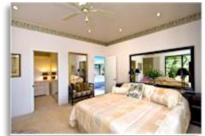
Bedroom linens, bedding, and all other washable surfaces

Mix 2 ounces of ZymeAway concentrate into 1-gallon of water. Pour this mixture into a handy spray bottle and clean surfaces in the following manner.