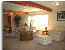
All fabrics, furniture, and carpeting (stains & odors)