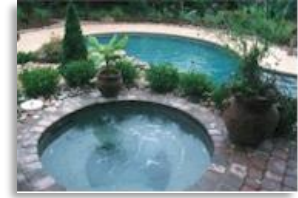
Hot tubs and spa cleaning and other washable surfaces

Mix 4 ounces of ZymeAway concentrate into 1-gallon of water. Pour this mixture into a sprayer and spray mixture over mold, mildew, or other organic dirt and debris. Use a long handled brush (soft to medium bristle) and brush mixture into the surface and allow it to penetrate into the debris for up to 5-minutes. Next, thoroughly rinse away all mixture, dirt or debris from the surface with clean water and allow to air dry. Repeat this cleaning method where or as necessary. NOTE: Mold “stains” are NOT mold, but the liquid molds deposit into the surface to break-down its food. Mold is always cleaned away thoroughly and completely the first time you wash using this cleaning method. Mold stains may require a mixture of baking soda and ZymeAway and then brushing this mixture into the stains. All outdoor washable surfaces will respond favorably when cleaned with our enzyme liquid energy product... ZymeAway!