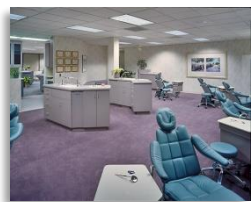
Hospitals, clinics and dental centers and offices