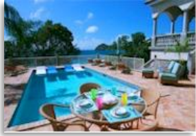
Outdoor – All stone, patios, marble, and brick surfaces