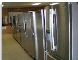
Stainless Steel Appliances