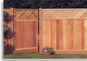
Cleaning wood, decks, siding, and other washable surfaces