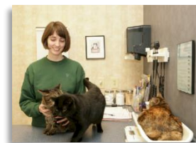
Veterinary clinics and animal rescue centers

In all cleaning situations, you will know if 2-ounces or 4-ounces will work best. Two-ounces is considered general purpose and the 4-ounce mixture is considered professional strength.