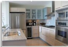
All kitchen surfaces, appliances, and flooring