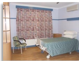
Nursing homes and wellness centers