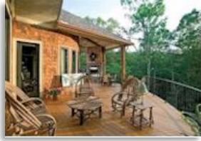
Mold & mildew on vinyl, wood, aluminum surfaces