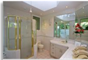
All bathroom surfaces, fixtures, and tile & grout