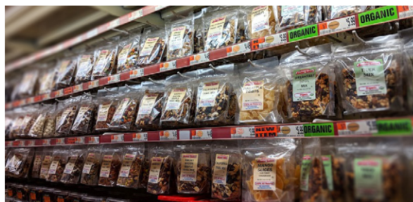
These pouches are great for R&D, trial, beta testing and market introduction phases of product development.