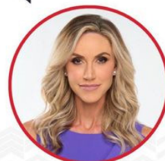
LARA TRUMP CO-CHAIR