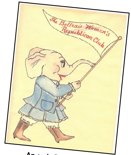
An early BWRC logo