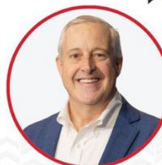
MICHAEL WHATLEY RNC CHAIR