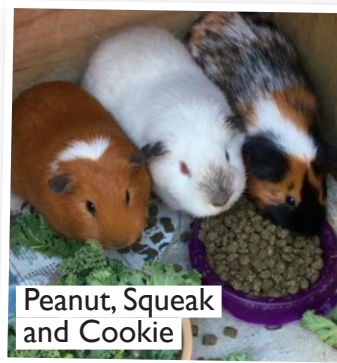
Peanut, Squeak and Cookie

I was brought up in Stanmore and even went to Stanburn school - a long time ago! My brother and sister actually attended Stanmore Baptist playgroup but sadly I did not get that opportunity. My daughter also came to the playgroup and we belong to the church so I have had links with Preschool for a long time. In my spare time I like to cook, garden, sew and knit. During lockdown I have been enjoying making my own bread and getting to use my sewing machine again. I also love swimming but have not been able to do that lately, so instead I've tried to walk as much as possible. We have 3 guinea pigs at home. They are supposed to be my daughter's but you wouldn't think that if you saw who does most of the looking after! She'd love a dog too but I've not given in to that. Here's a picture of them.