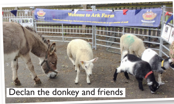
Declan the donkey and friends

All was soon revealed as a selection of animals from Ark Farm were quickly led into their new surroundings for the morning. Very soon a group of little faces were pressed up against the Foyer window very excited about what they could see. Once in the car park and by the pen, the children listened very carefully to the instructions on how to stroke the animals and to be quiet around them so they didn't frighten the animals. They were told the names of the animals, there was Declan the donkey and Hat and Scarf the goats.