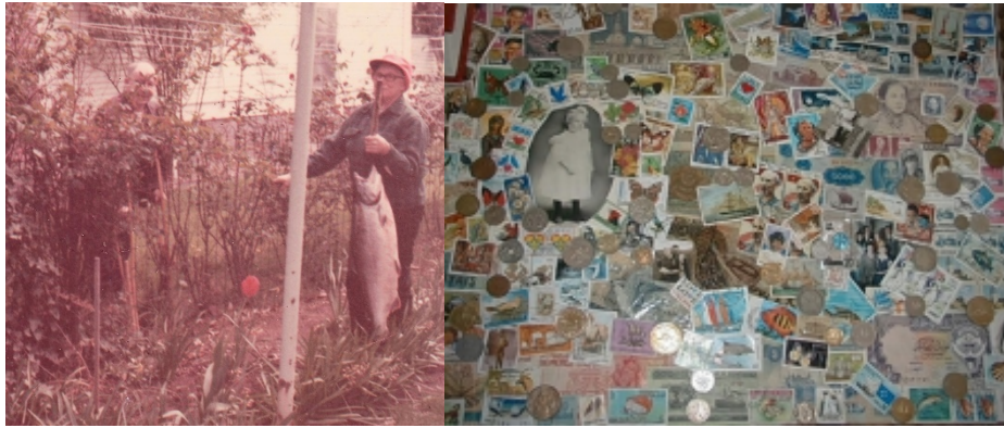
My grandmother showing her salmon to a neighbor and my Grandmother's Trunk