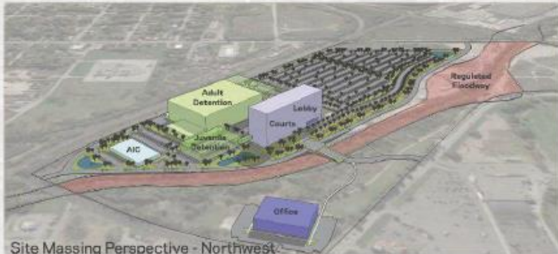
Site Massing Perspective - Northwest