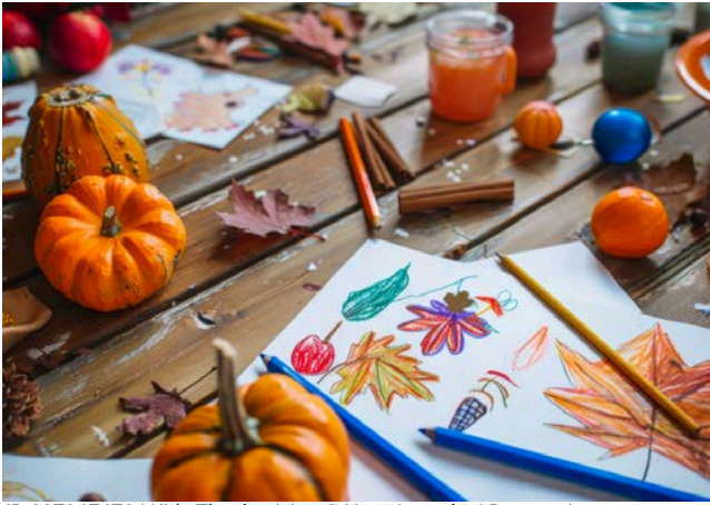
ID 327967679 | Kids Thanksgiving