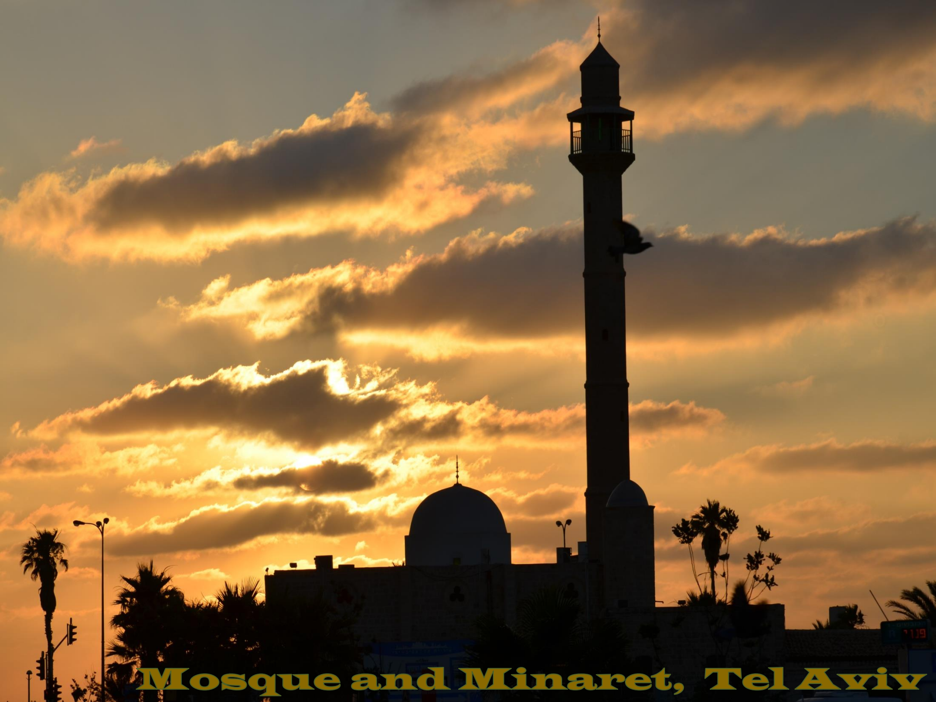
Mosque and Minaret, Tel Aviv