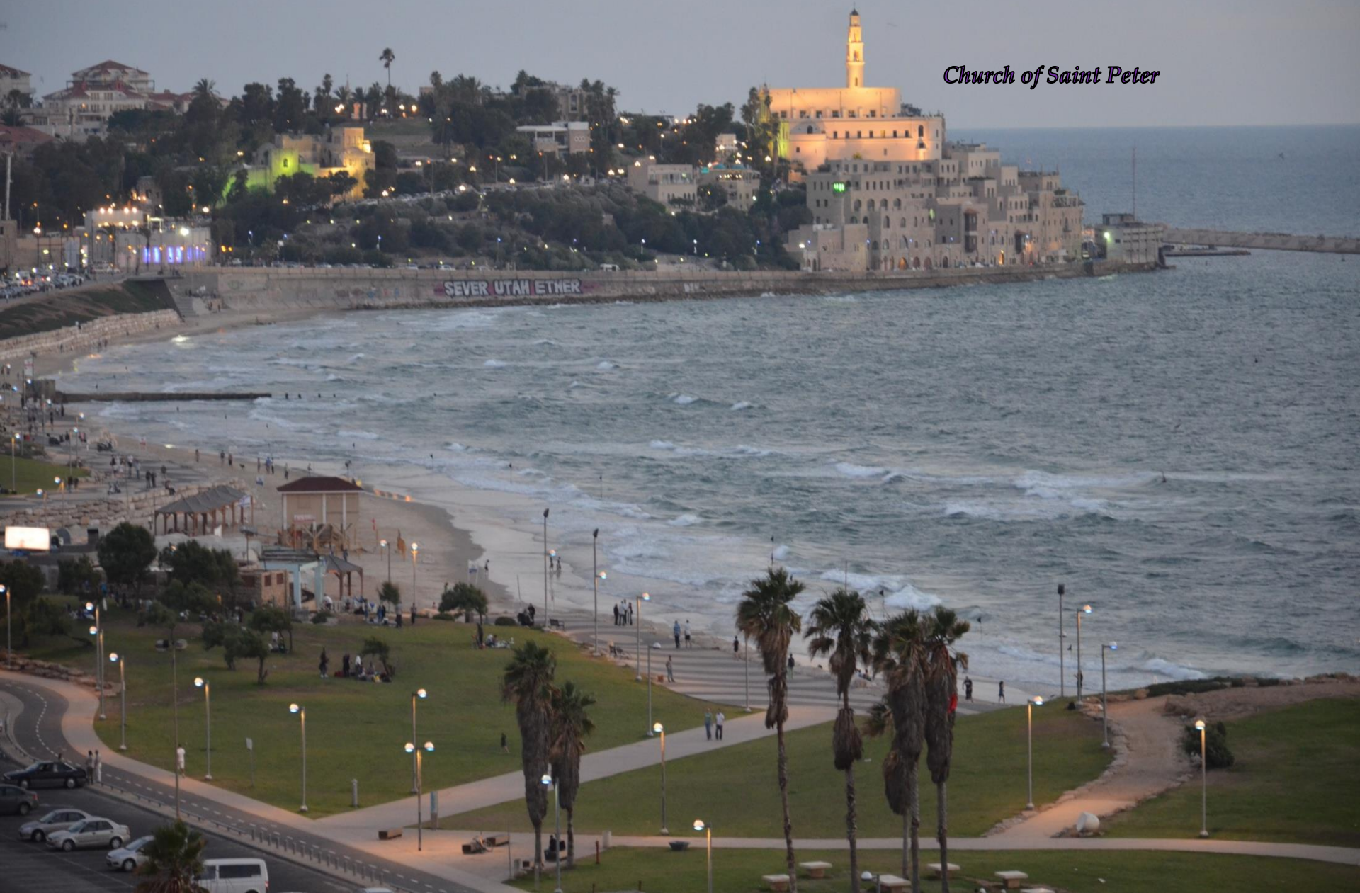
Church of Saint Peter