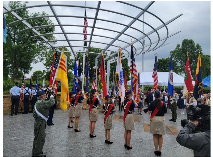
Woodbury Post 501's Memorial Day photos