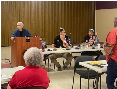
3rd District Family Gathering