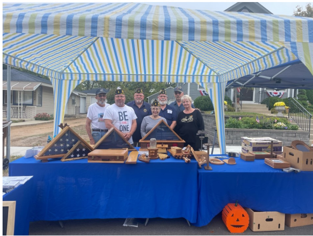
Post 447 All handmade items --Pleasant Street Art Walk