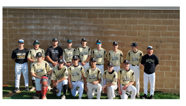
East Ridge High School Legion Baseball team

Join the Post in cheering on the Legion teams and show your support.