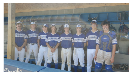
Woodbury High School Legion Baseball (Blue team)